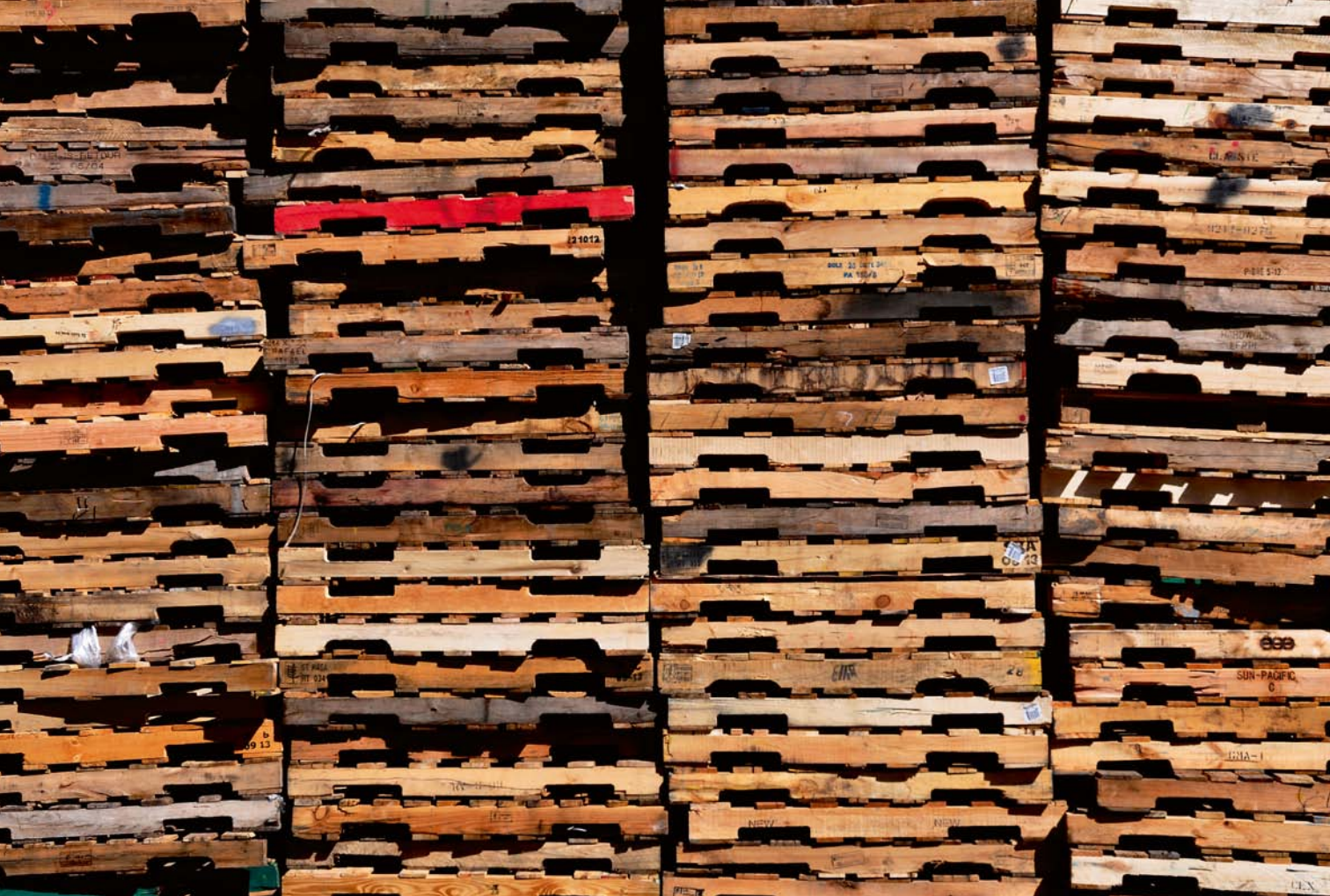
Skid row at Pallets Unlimited, New Hyde Park, Long Island.