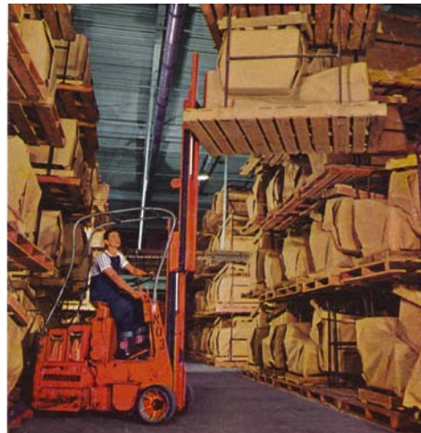
Having proven their worth in the war effort, pallets became a staple of postwar industry. A forklift operator moves goods at a Salt Lake City warehouse.

Blue pallets are an inch or so taller, often cleaner, and always more uniform than the pallets of whitewood. Crucially, blues do not have any stringer boards along their sides; instead, their height is obtained by way of nine wooden blocks sandwiched between the top and bottom deck boards. This block design allows forklifts and other tools to enter the pallet with equal ease from four directions. (Most stringer pallets, by contrast, offer either "two-way entry" or "partial four-way entry.") There